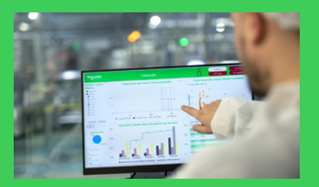
See our digital services for industrial automation